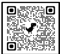
WPATH Standards of Care

The QR codes below can be scanned with your cell phone camera for more information.